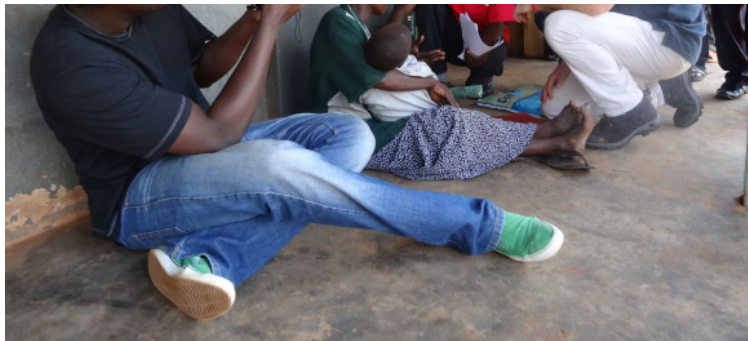
The last five

Diese Projekte brauchen Unterstützung! Fotoimpressionen aus Uganda